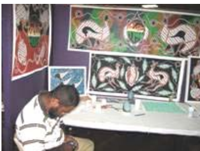
above – Computers 4 Kits below – Aboriginal Art & Emu Carving