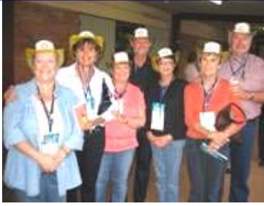
Some of Mooloolaba