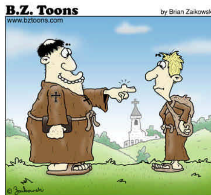
Saint John's wort.

As soon as she finished her speech, all the men started clapping.