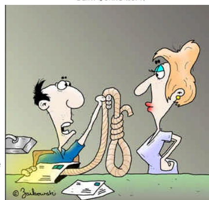
It's from the credit card company. More rope to hang ourselves with.